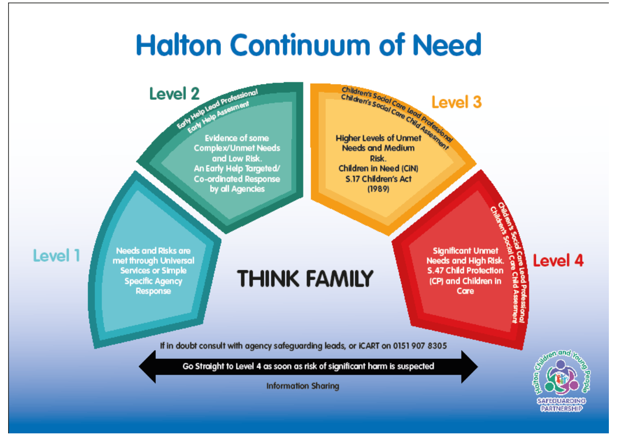
Appendix B – Halton's Level of Need Framework

children is a specific safeguarding issue (also known as child-on-child abuse) in education and all staff should be aware of it and their school or or colleges policy and procedures for dealing with it.